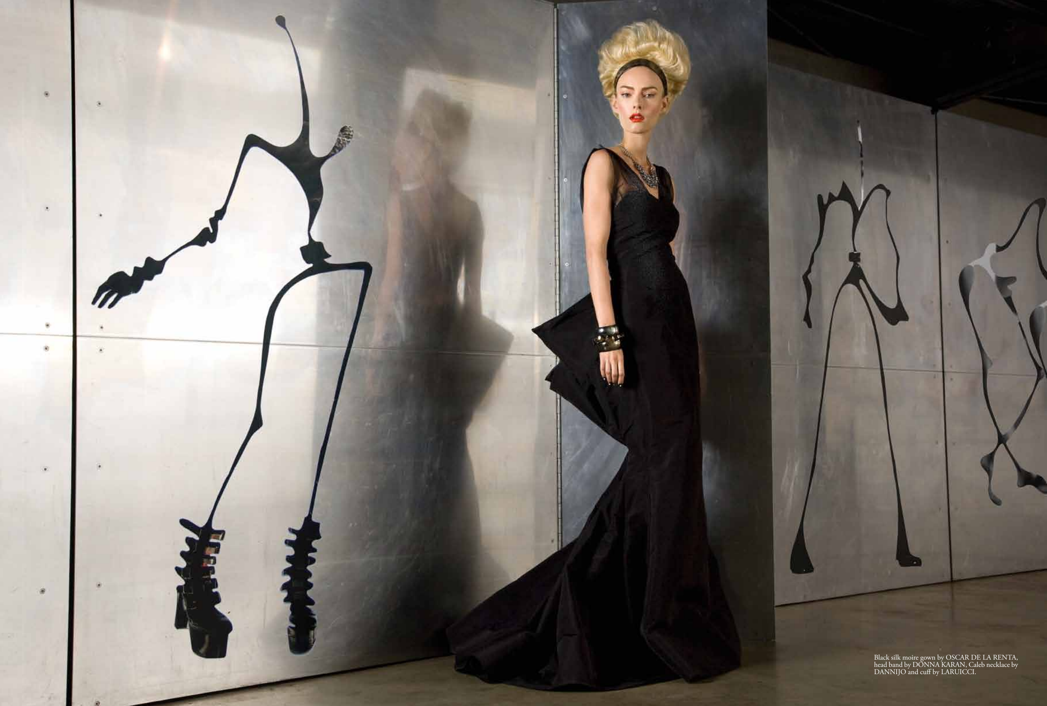
Black silk moire gown by OSCAR DE LA RENTA, head band by DONNA KARAN, Caleb necklace by DANNIJO and cuff by LARUICCI.