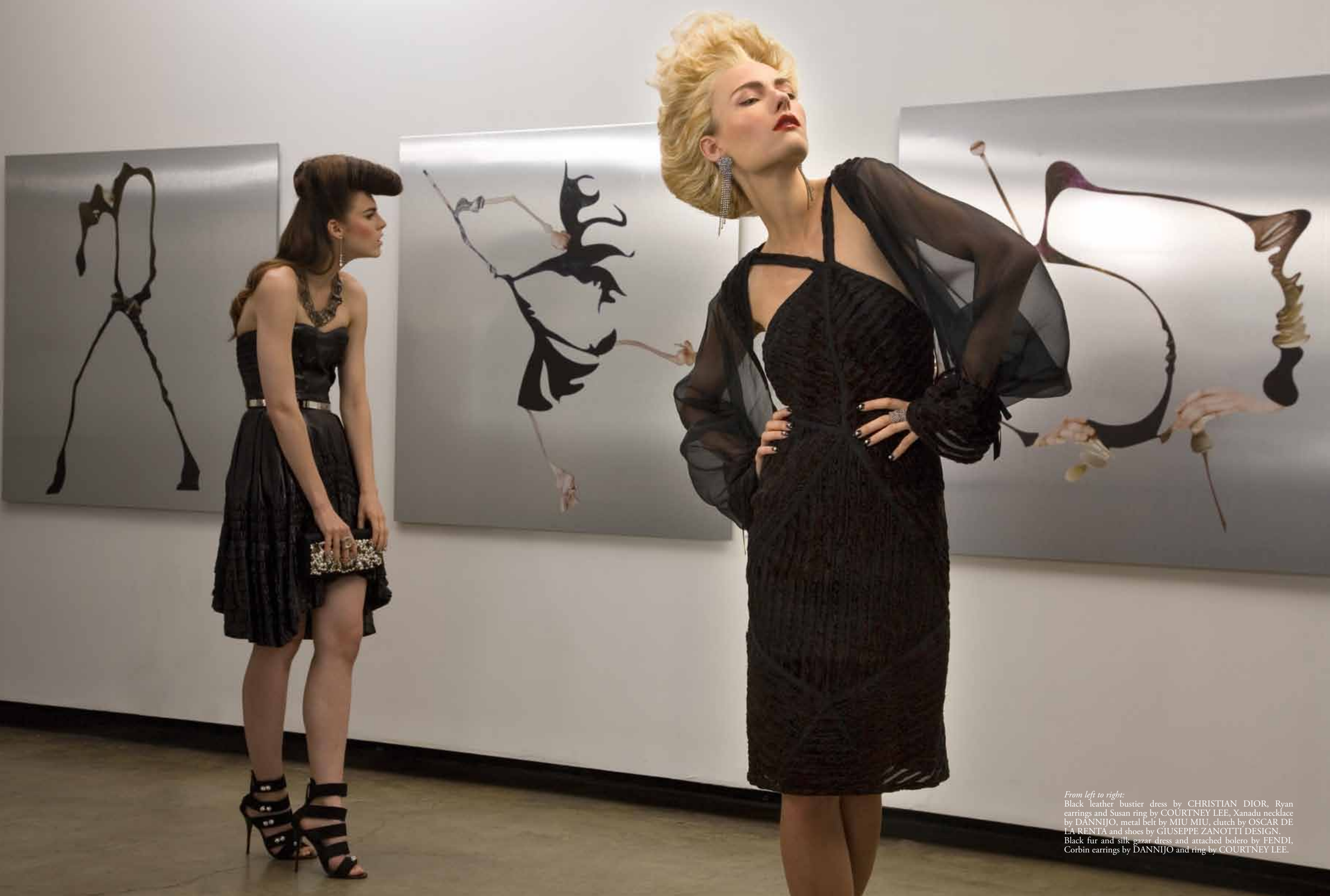
From left to right: Black leather bustier dress by CHRISTIAN DIOR, Ryan earrings and Susan ring by COURTNEY LEE, Xanadu necklace by DANNIJO, metal belt by MIU MIU, clutch by OSCAR DE LA RENTA and shoes by GIUSEPPE ZANOTTI DESIGN. Black fur and silk gazar dress and attached bolero by FENDI, Corbin earrings by DANNIJO and ring by COURTNEY LEE.