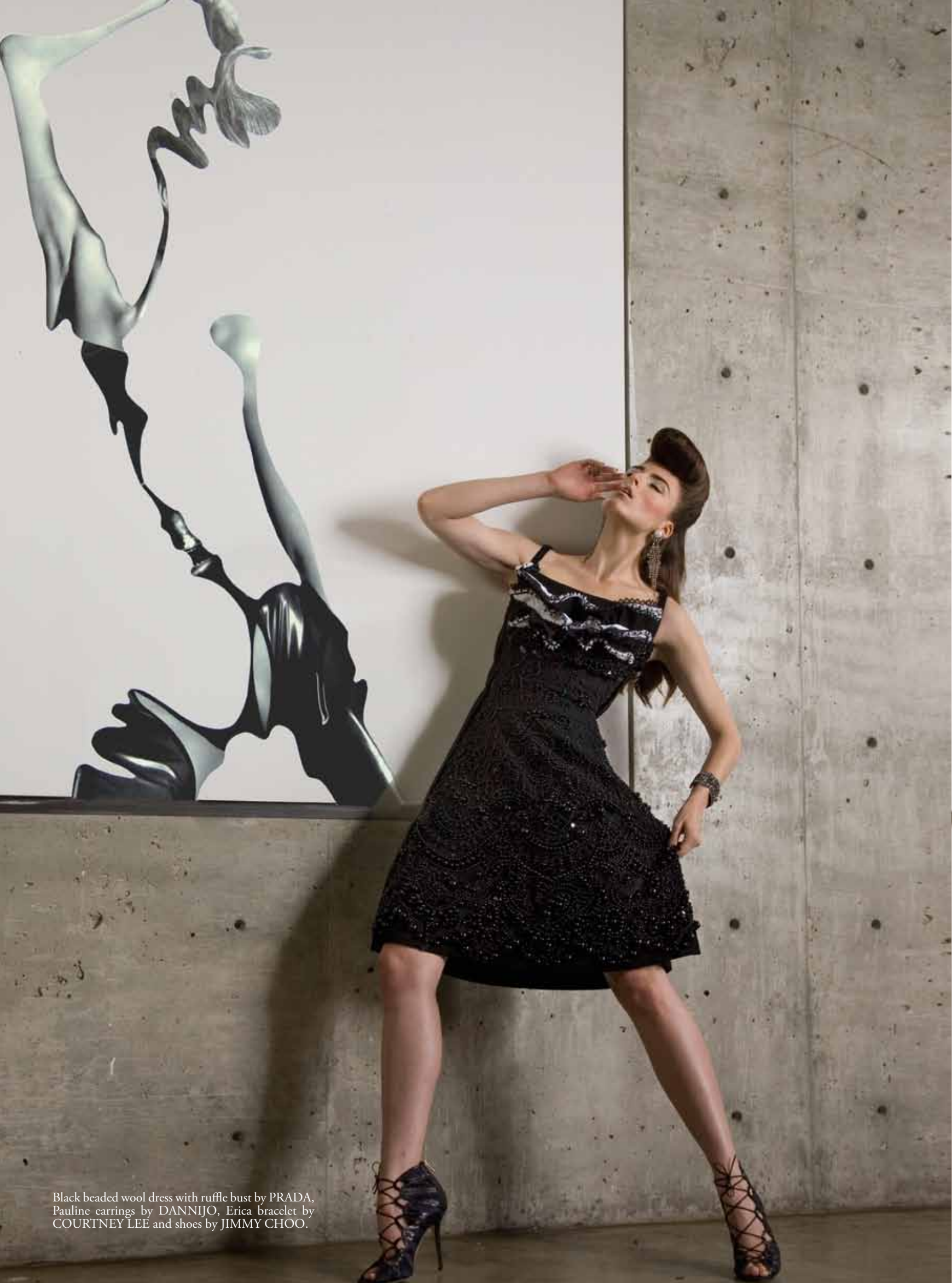
Black beaded wool dress with ruffle bust by PRADA, Pauline earrings by DANNIJO, Erica bracelet by COURTNEY LEE and shoes by JIMMY CHOO.